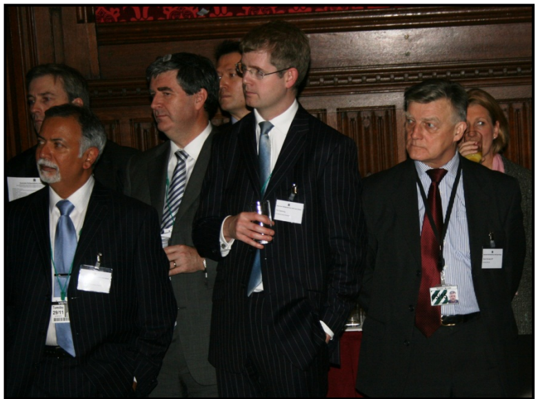
Steve McCabe MP for Selly Oak and co-chair of the APLLG is pictured on far right above with associate members, colleagues' and patient attendees also at the reception

To launch the inaugural European Limb Loss Day on the 3 rd December 2011, and maximise the benefits to people of all ages with Limb Loss, caring members of both Houses of Parliament attended a reception at the House of Commons on Tuesday 29 th November 2011 with invited guests, which was generously sponsored by Otto Bock Healthcare, Össur and